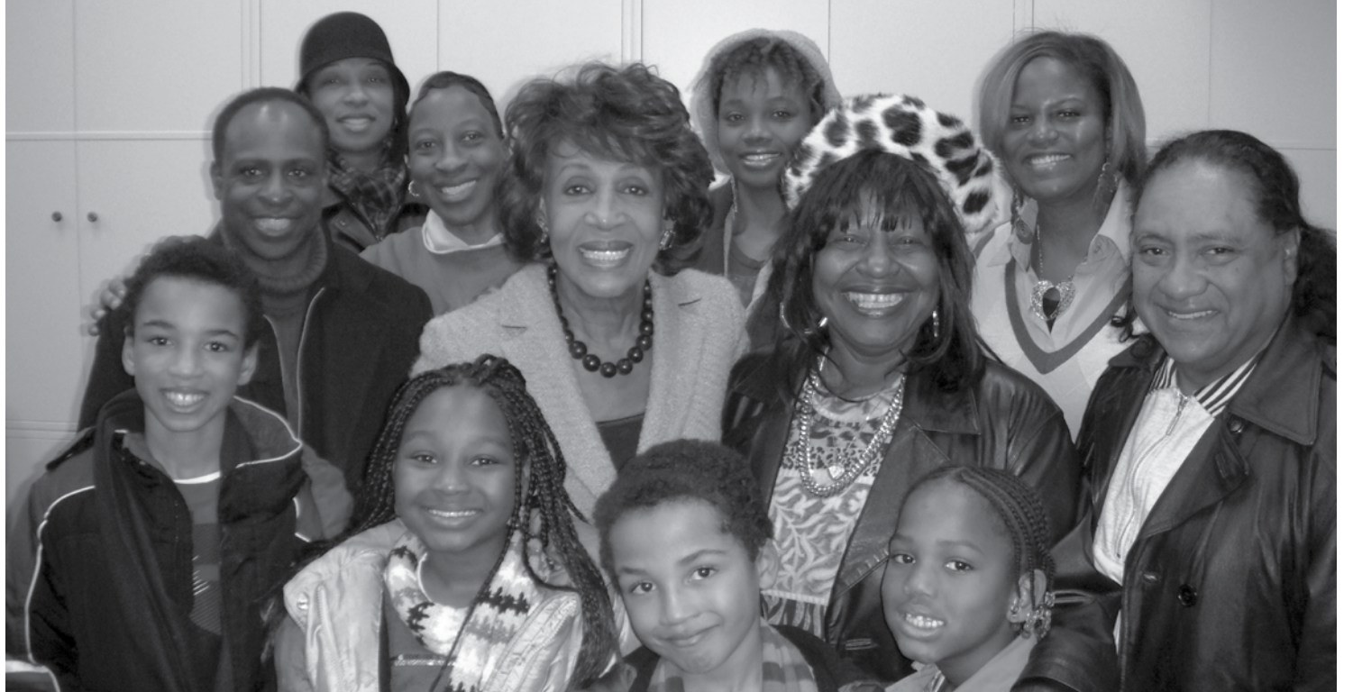
Congresswoman Maxine Waters (D-CA) welcomed constituents of the 43rd district in town for the Presidential inaugural ceremonies to her Washington, D.C. office during Inauguration weekend. "It was wonderful to meet with my constituents as they traveled to Washington to witness the second inauguration of President Barack Obama on Martin Luther King, Jr. Day," said Congresswoman Maxine Waters. "It was a historic moment for our country, and I'm honored my constituents had an opportunity to take part in it." Seen here Congresswoman Waters with students, parents and staff from Frederick KC Price III School.